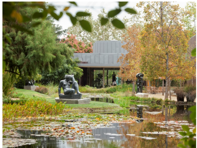
Norton Simon Museum Sculpture Garden