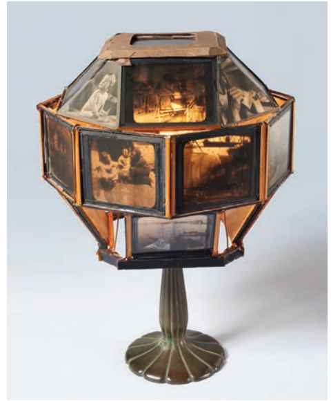
Assembly Lamp Eight , 1966 Jess (American, 1923–2004) Assemblage: electric lamp base and octagonal shade constructed of wood, copper wire, plastic, magazine clippings, tape, black paint, glue and glass projection lanterns 16 in. high (40.6 cm); 9-1/2 in. diam. (24.1 cm) Norton Simon Museum, Gift of Odysia Skouras, P.2004.05 © 2016 Jess Collins Trust