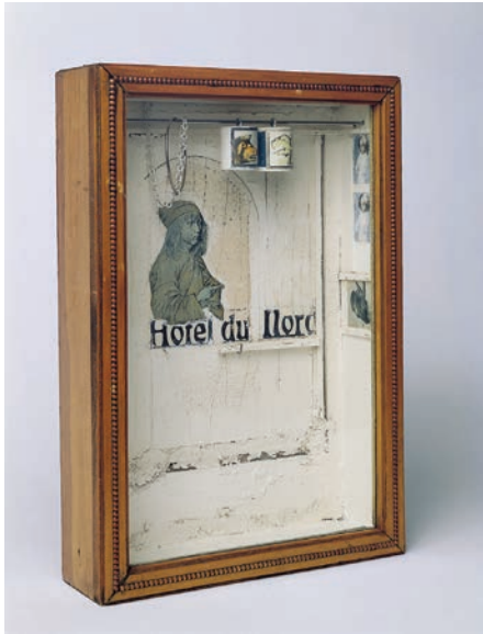
Hotel du Nord (Little Dürer) , c. 1950 Joseph Cornell (American, 1903–1972) Assemblage 13 x 12-1/4 x 4 in. (33 x 31.1 x 10.1 cm) Norton Simon Museum, Museum Purchase with funds contributed by the Charles and Ellamae Storrier-Stearns Fund and Fellows Acquisition Fund, P.1967.10 Art © The Joseph and Robert Cornell Memorial Foundation/Licensed by VAGA, New York, NY

We are pleased to provide the following images for publicity relating to the exhibition. To receive digital versions of the images, email media@nortonsimon.org .