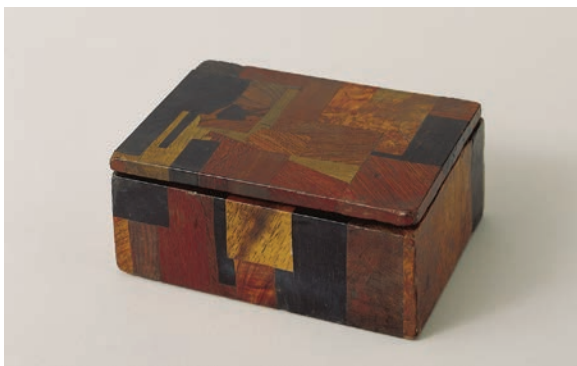
Lust Murder Box No. 2 , 1920–1922 Kurt Schwitters (German, 1887–1948) Inlaid exotic wood box (crafted by Albert Schulze, Hannover) 2-1/8 x 5 x 3-3/4 in. (5.4 x 12.7 x 9.5 cm) Norton Simon Museum, Gift of Kate Steinitz, P.1969.087 © 2016 Artists Rights Society (ARS), New York / VG Bild-Kunst, Bonn