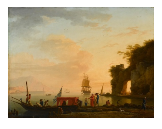
German Modernism in California