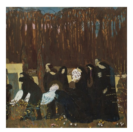
R.I.P.: On Art and Mourning