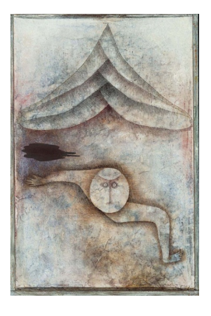
Flags of Refuge: Symbols of Sanctuary Saturday, August 12, 1:30—4:00 p.m. Sunday, August 13, 1:30—4:00 p.m.