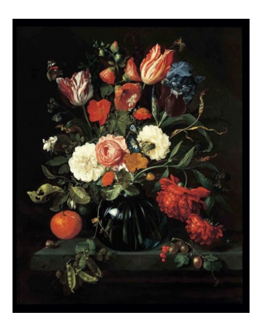
Session 2: Thursday, August 3, 2:00–4:00 p.m. Botanicals: Flower Structure

Examining the Museum's emblematic Dutch still lifes, Jamie Sweetman discusses structural composition. Drawing from a bouquet of artificial flowers, Sweetman demonstrates how to break down blossoms into simple shapes.