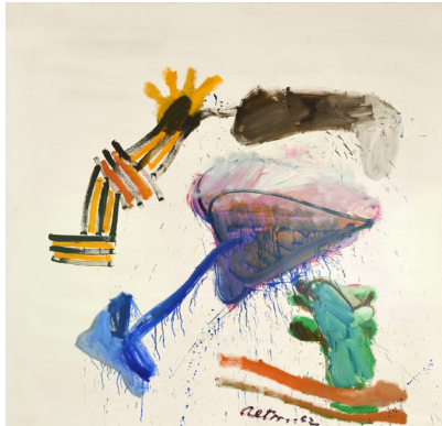
John Altoon (American, 1925–1969) Ocean Park Series #8 , 1962 Oil on canvas 81-1/2 x 84 in. (207 x 213.4 cm) Norton Simon Museum, Anonymous Gift © Estate of John Altoon, Kohn Gallery

The image(s) provided are exclusively for the press and may only be used for purposes of publicity for the exhibition. Any other use will require written permission from the Norton Simon Entities*. All images are the property of the Norton Simon Entities. All copyright and credits must appear on the same or facing page(s) as the image(s). Please refer below for proper notation of image caption(s) and credit(s).