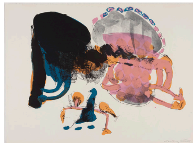
John Altoon (American, 1925–1969) Untitled , 1965 Lithograph Sheet: 22 x 30 in. (55.9 x 76.2 cm); Image: 21-1/2 x 25 in. (54.6 x 63.5 cm) Norton Simon Museum, Anonymous Gift © Estate of John Altoon, Kohn Gallery