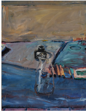
Richard Diebenkorn (American, 1922–1993) Bottles , 1960 Oil on canvas 34 x 26 in. (86.4 x 66 cm) Norton Simon Museum, Gift of the Artist © Richard Diebenkorn Foundation

May 13–August 22, 2022 at the Norton Simon Museum