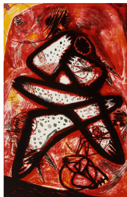
Frank Lobdell (American, 1921–2013) Untitled , 1966 Lithograph 32 x 20-1/4 in. (81.28 x 51.44 cm.) Norton Simon Museum, Anonymous Gift © Frank Lobdell Trust