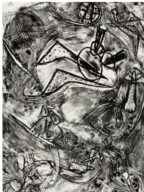
Frank Lobdell (American, 1921–2013) Untitled , 1966 Lithograph 27 x 20 in. (68.58 x 50.8 cm.) Norton Simon Museum, Anonymous Gift © Frank Lobdell Trust