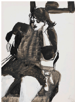
Frank Lobdell (American, 1921–2013) Figure Drawing Series No. 33 , 1966 Ink and gouache on coated paper 17 x 12-1/2 in. Norton Simon Museum, Gift of The Frank Lobdell Trust © Frank Lobdell Trust