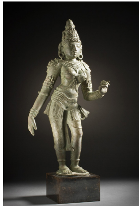
Sridevi , 11th century India: Tamil Nadu Bronze 16-3/8 in. (41.6 cm) The Norton Simon Foundation