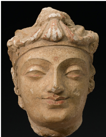
Head of a Bodhisattva or Deity , 4th-5th century Pakistan or Afghanistan: Ancient Gandhara Polychromed stucco 6-1/4 in. (15.9 cm) The Norton Simon Foundation