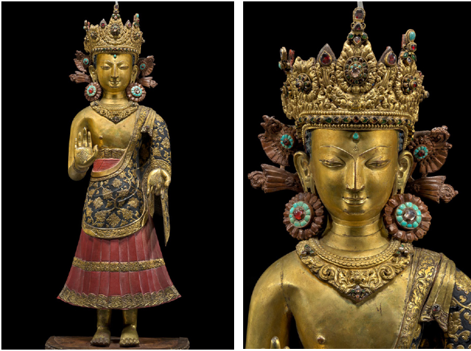
Dipankara Buddha (and detail), c. 1600–1650 Nepal Gilt and enameled copper with semiprecious stones and pigments 32-1/2 in. (82.6 cm) Norton Simon Art Foundation

October 13, 2023–February 19, 2024 at the Norton Simon Museum