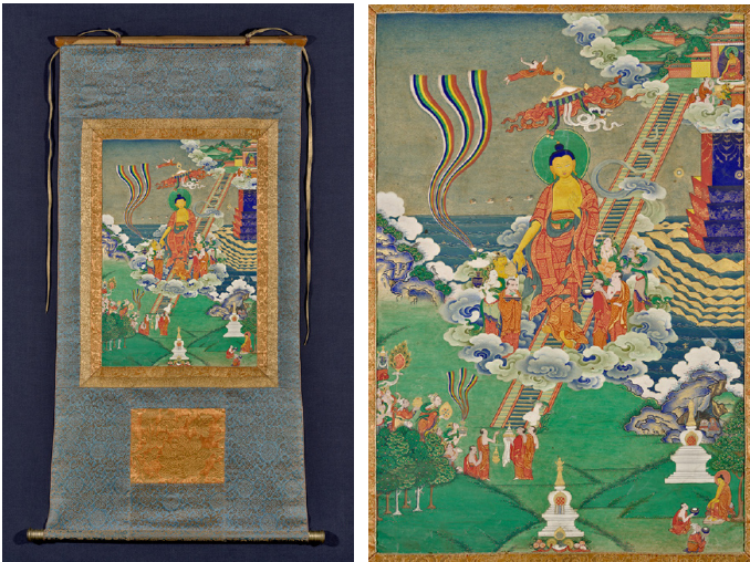
Descent of the Buddha (and detail), 19th century Attributed to Phurbu Tshering of Chamdo Opaque watercolor and gold on cotton with silk border thanka: 18 x 12-1/4 in. (45.7 x 31.1 cm); overall: 39-1/2 x 23-1/2 in. (100.3 x 59.7 cm) Norton Simon Museum, Gift of Pratap and Chitra Pal