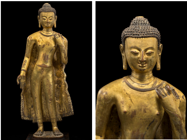
Buddha Shakyamuni (and detail), 12th century Nepal or Tibet Gilt-copper alloy with traces of pigment 27-1/2 in. (69.9 cm) The Norton Simon Foundation