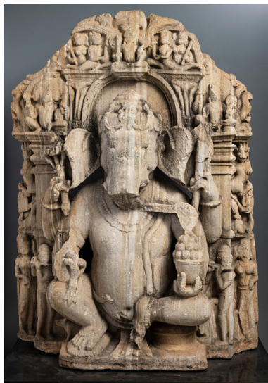
Ganesha with the Hindu Triad, 10th century India: Rajasthan (?) Limestone 34 x 24-1/2 x 9 in. (86.4 x 62.2 x 22.9 cm) The Norton Simon Foundation