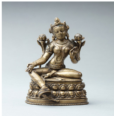
Tara , 12th century India: West Bengal or Bangladesh Brass 4-5/8 x 3-5/16 in. (11.7 x 8.4 cm) The Norton Simon Foundation

The image(s) provided are exclusively for the press and may only be used for purposes of publicity for the exhibition. Any other use will require written permission from the Norton Simon Entities*. All images are the property of the Norton Simon Entities. All copyright and credits must appear on the same or facing page(s) as the image(s). Please refer below for proper notation of image caption(s) and credit(s).