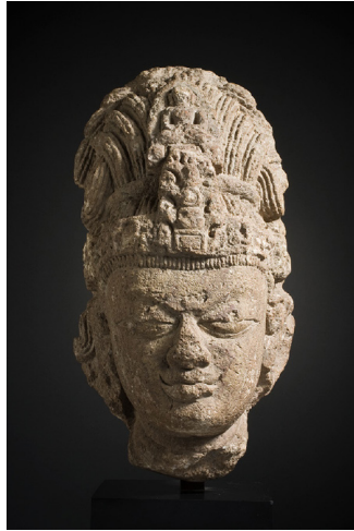
Head of Bodhisattva Avalokiteshvara, 9th century India: Odisha, Ratnagiri Grey-brown gneiss 13-1/2 x 7 x 7 in. (34.3 x 17.8 x 17.8 cm) The Norton Simon Foundation

October 13, 2023–February 19, 2024 at the Norton Simon Museum