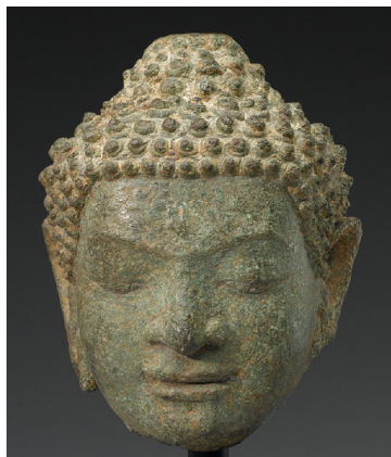
Head of Buddha Shakyamuni , 8th century Thailand: Mon-Dvaravati period Bronze 6-1/2 in. (16.5 cm) The Norton Simon Foundation