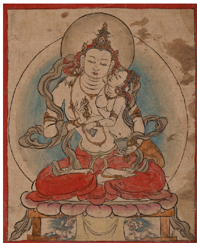
Vajrasatva and Vajrasatvatmika , 17th century Tibet (?) Pigment on paper comp: 7-1/8 x 5-3/4 in. (18.1 x 14.6 cm); sheet: 7-7/8 x 6-1/4 in. (20.0 x 15.9 cm) Norton Simon Museum, Gift of Pratap and Chitra Pal in memory of H. E. Richardson