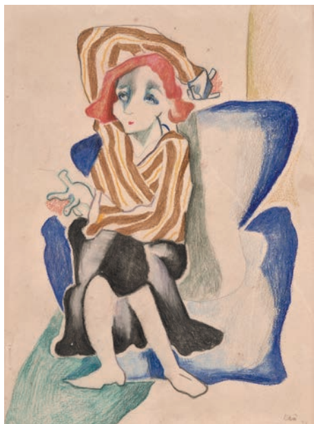
Beatrice Wood (American, 1893–1998) Portrait of Galka Scheyer , 1934 Colored pencil on paper 15 1/4 x 9 1/2 in. (38.7 x 24.1 cm) Norton Simon Museum, The Blue Four Galka Scheyer Collection © Beatrice Wood Center for the Arts/Happy Valley Foundation