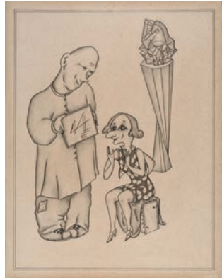
Edward Hagedorn (American, 1902–1982) Galka Scheyer Viewing Modern Portraits of Galka Scheyer , c. 1926–28 Graphite on wove paper comp: 23 1/8 x 18 in. (58.7 x 45.7 cm); sheet: 25 1/8 x 20 1/8 in. (63.8 x 51.1 cm) Norton Simon Museum, Anonymous Gift, Courtesy of Denenberg Fine Arts © Denenberg Fine Arts, Inc.

At the Norton Simon Museum February 20 – July 20, 2026