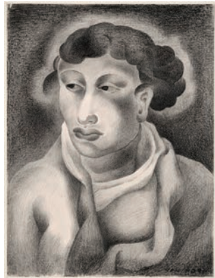
Lucretia Van Horn (American 1882–1970) Portrait of Galka Scheyer , 1927–30 Black crayon on wove paper 12 1/2 x 9 1/2 in. (31.8 x 24.1 cm) Norton Simon Museum, The Blue Four Galka Scheyer Collection © Lucretia Van Horn