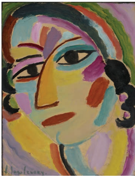
Alexei Jawlensky (Russian, 1864–1941) Mystical Head: Galka , 1917 Oil and pencil on tan textured cardboard 15 1/2 x 12 in. (39.4 x 30.5 cm) Norton Simon Museum, The Blue Four Galka Scheyer Collection

The image(s) provided are exclusively for the press and may only be used for purposes of publicity for the exhibition. Any other use will require written permission from the Norton Simon Entities*. All images are the property of the Norton Simon Entities. All copyright and credits must appear on the same or facing page(s) as the image(s). Please refer below for proper notation of image caption(s) and credit(s).