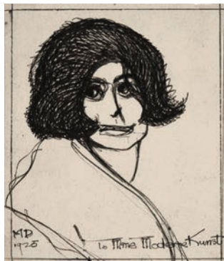
Maynard Dixon (American, 1875–1946) Portrait of Galka Scheyer , 1925 India ink on wove paper comp: 3 3/4 x 3 1/4 in. (9.5 x 8.3 cm); sheet: 4 x 3 3/8 in. (10.2 x 8.6 cm) Norton Simon Museum, The Blue Four Galka Scheyer Collection