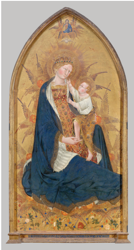
Giovanni di Paolo (Italian, 1403-1482) Branchini Madonna , 1427 Tempera and gold leaf on panel 72 x 39 in. (182.9 x 99.1 cm) The Norton Simon Foundation

The image(s) provided are exclusively for the press and may only be used for purposes of publicity for the exhibition. Any other use will require written permission from the Norton Simon Entities*. All images are the property of the Norton Simon Entities. All copyright and credits must appear on the same or facing page(s) as the image(s). Please refer below for proper notation of image caption(s) and credit(s).