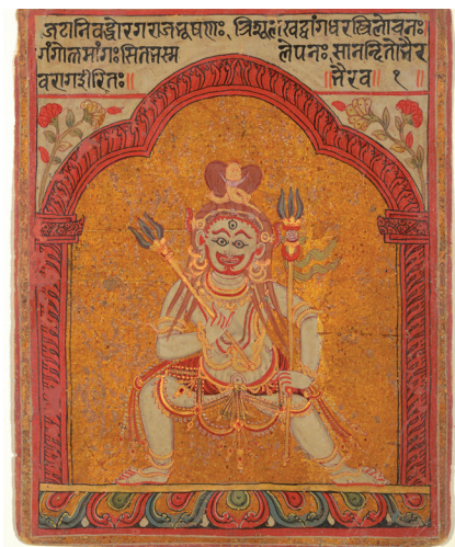
Asia: Nepal, Bagmati Province, Bhaktapur Ragamala Album: Bhairava Raga , c. 1625 Opaque watercolor and gold on paper 7 x 5 1/2 in. (17.8 x 14 cm) Norton Simon Art Foundation, Gift of Mr. Norton Simon