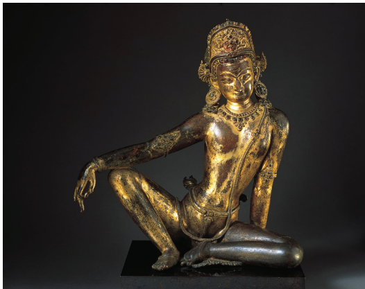
Asia: Nepal Indra , 13th century Gilt bronze 16 1/8 x 12 3/16 x 6 in. (41 x 31 x 15.2 cm) The Norton Simon Foundation