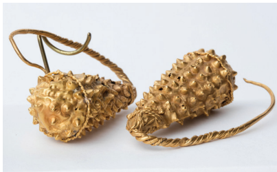
Europe: Roman Pair of Earrings, 3rd century CE Gold Each: 2 1/2 x 1 1/2 in. (6.4 x 3.8 cm) The Norton Simon Foundation