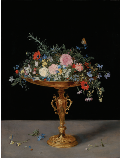
Jan Brueghel the Younger (Flemish, 1601-1678) Flowers in a Gilt Tazza , c. 1620 Oil on panel 21 3/4 x 16 3/4 in. (55.2 x 42.6 cm) The Norton Simon Foundation

At the Norton Simon Museum October 24, 2025 – February 16, 2026