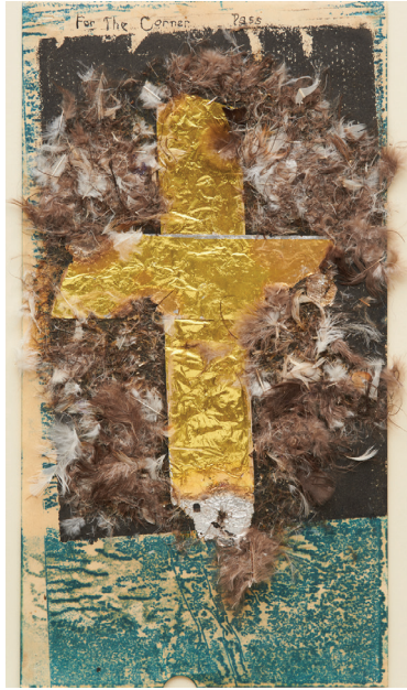
George Herms (American, b. 1935) For the Corner Pass , 1962 Collage of paper, foil, ink and feathers on paper 16 x 8 1/2 in. (40.6 x 21.6 cm) Norton Simon Museum, Gift of the Artist © George Herms

At the Norton Simon Museum October 24, 2025 – February 16, 2026