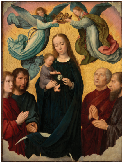
Gerard David (Netherlandish, c. 1460-1523) The Coronation of the Virgin, Maria in Sole , c. 1515 Oil on panel 28 x 21 1/2 in. (71.1 x 54.6 cm) The Norton Simon Foundation