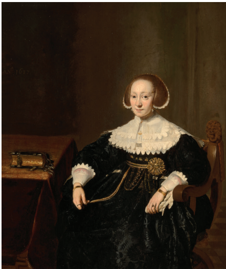
Thomas de Keyser (Dutch, 1596/97-1667), or Follower Portrait of a Woman , 1637 Oil on panel 18 x 15 1/2 in. (45.7 x 39.4 cm) The Norton Simon Foundation