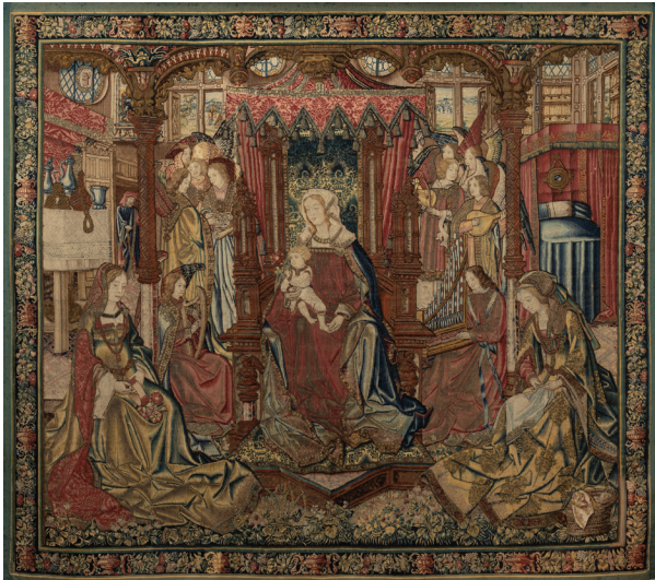
Europe: Flanders Holy Family with Music-Making Angels, c. 1520 Wool tapestry with silk and gold threads (woven at Brussels) 101 1/8 x 115 in. (256.8 x 292.1 cm)

Image(s) are to be printed in their entirety and are not to be cropped, altered or manipulated in any way. Any alterations must be approved in writing by the Norton Simon Entities*. Any unauthorized use of the photographic materials shall constitute an infringement of copyright laws. Please let us know if you have any questions or need additional materials. We would appreciate one copy of the publication or article in which the image(s) appears for our files.