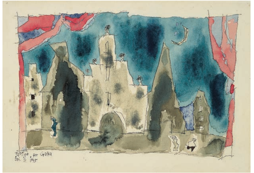
Untitled, c.1945 Lyonel Feininger (American, 1871-1956) Watercolor, silver pigment and India ink on laid paper 8-5/8 x 12-1/2 in. (21.9 x 31.8 cm) Norton Simon Museum, The Blue Four Galka Scheyer Collection