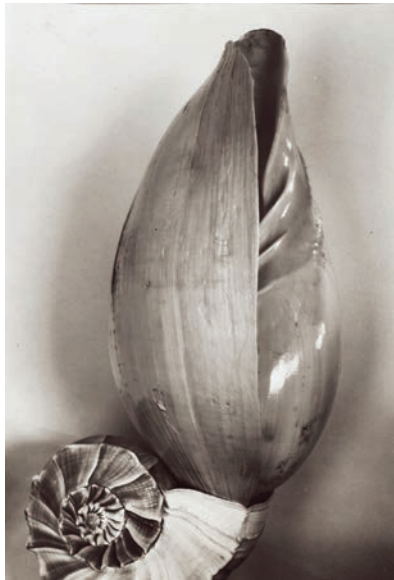
Two Shells, 1927 Edward Weston (American, 1886-1958) Gelatin silver print Image: 9-5/16 x 6-1/2 in. (23.7 x 16.5 cm) Norton Simon Museum, The Blue Four Galka Scheyer Collection