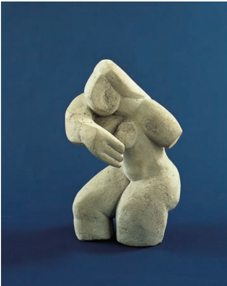
Suzanne, 1909 Alexander Archipenko (Russian/American, 1887-1964) Limestone 15-3/8 x 10 x 8-5/8 in. (39.0 x 25.4 x 21.9 cm) Norton Simon Museum, The Blue Four Galka Scheyer Collection

We are pleased to provide the following images for publicity relating to the exhibition. To receive digital versions of the images, please contact the External Affairs department at (626) 844-6900 or media@nortonsimon.org .