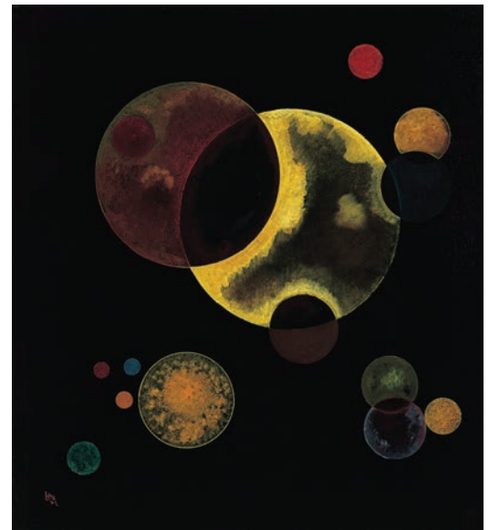
Heavy Circles, 1927 Vasily Kandinsky (Russian, 1866-1944) Oil on canvas 22-1/2 x 20-1/2 in. (57.2 x 52.1 cm) Norton Simon Museum, The Blue Four Galka Scheyer Collection