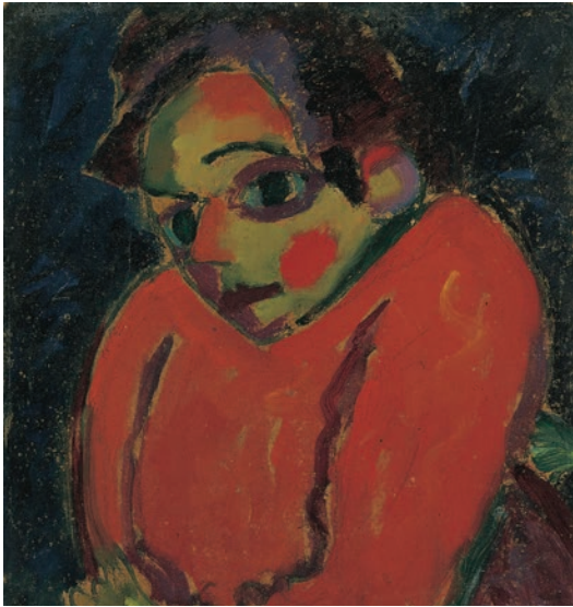
Hunchback, 1917 Alexei Jawlensky (Russian, 1864-1941) Oil and pencil on textured cardboard 9-3/4 x 8-1/4 in. (24.8 x 21.0 cm) Norton Simon Museum, The Blue Four Galka Scheyer Collection

We are pleased to provide the following images for publicity relating to the exhibition. To receive digital versions of the images, please contact the External Affairs department at (626) 844-6900 or media@nortonsimon.org .