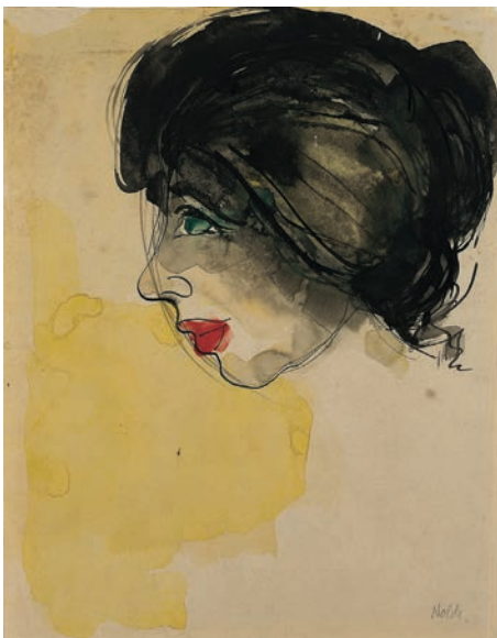
Head in Profile, 1919 Emil Nolde (German, 1867-1956) Watercolor and India ink on tan wove paper 14-1/2 x 11-1/8 in. (36.8 x 28.3 cm) Norton Simon Museum, The Blue Four Galka Scheyer Collection