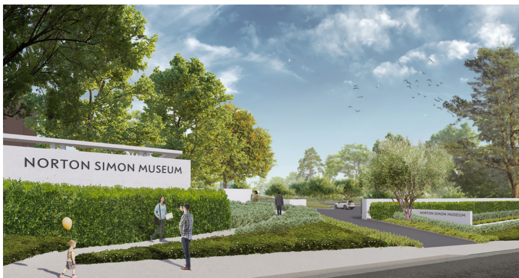
Rendering of the Norton Simon Museum's pedestrian walkway and main entrance, courtesy of ARG and SWA

The image(s) provided are exclusively for the press and may only be used for purposes of publicity for the exhibition. Any other use will require written permission from the Norton Simon Entities*. All images are the property of the Norton Simon Entities. All copyright and credits must appear on the same or facing page(s) as the image(s). Please refer below for proper notation of image caption(s) and credit(s).