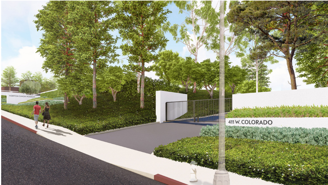
Rendering of the Norton Simon Museum's east driveway, courtesy of ARG and SWA

External Affairs Department 626.844.6900 media@nortonsimon.org