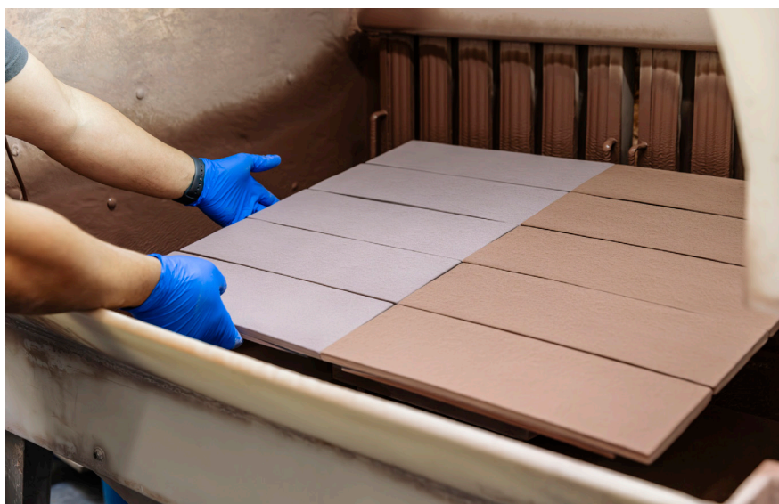
Above: Norton Simon Museum tile production at Heath Ceramics, San Francisco, November 2024

Image(s) are to be printed in their entirety and are not to be cropped, altered or manipulated in any way. Any alterations must be approved in writing by the Norton Simon Entities*. Any unauthorized use of the photographic materials shall constitute an infringement of copyright laws. Please let us know if you have any questions or need additional materials. We would appreciate one copy of the publication or article in which the image(s) appears for our files.