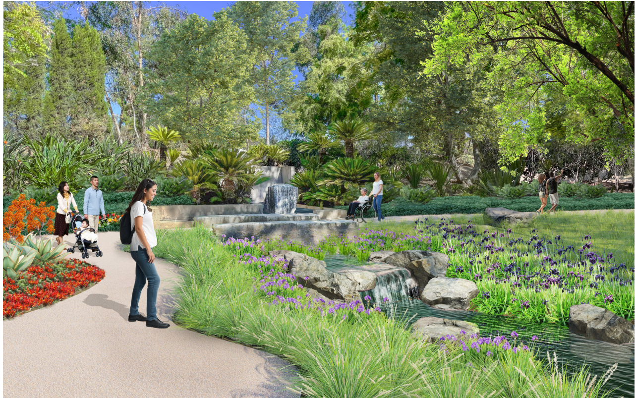
Rendering of the Norton Simon Museum's Sculpture Garden, courtesy of ARG and SWA

External Affairs Department 626.844.6900 media@nortonsimon.org