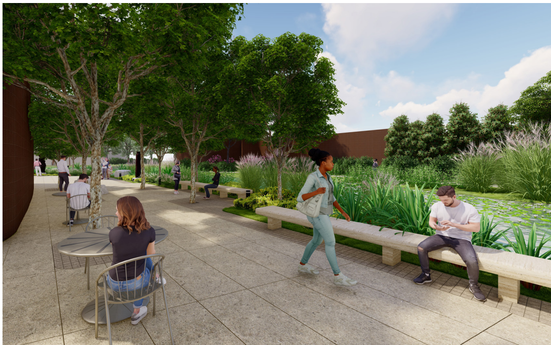
Rendering of the Norton Simon Museum's Sculpture Garden