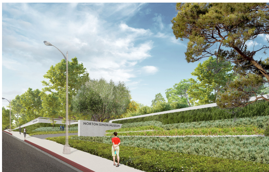
Rendering of the Norton Simon Museum's main entrance, courtesy of ARG and SWA