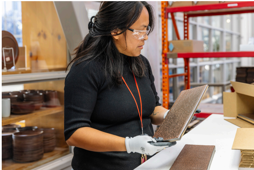
Above: Norton Simon Museum tile production at Heath Ceramics, San Francisco, November 2024