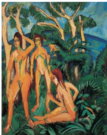
Image credit: Jan Davidzoon de Heem (Dutch, 1606–1683/84), Vase of Flowers, 1654, Oil on canvas, The Norton Simon Foundation; Ernst Ludwig Kirchner (German, 1880–1938), Bathers Beneath Trees, Fehrmann, 1913, Oil on canvas, Norton Simon Art