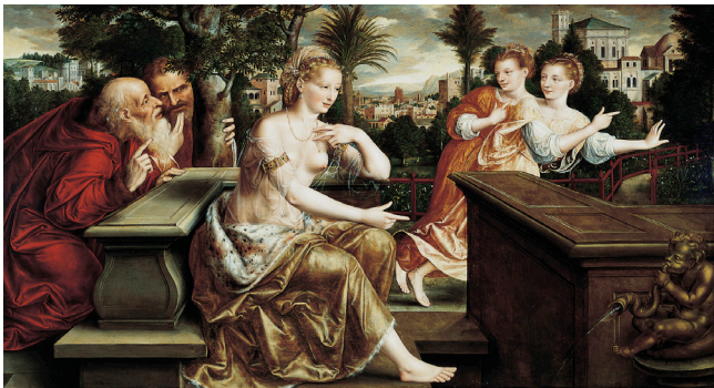
Jan Massys (Flemish, c. 1509–1575) Susanna and the Elders , 1564 Oil on panel 42 x 77-1/2 in. (106.7 x 196.9 cm) Norton Simon Art Foundation