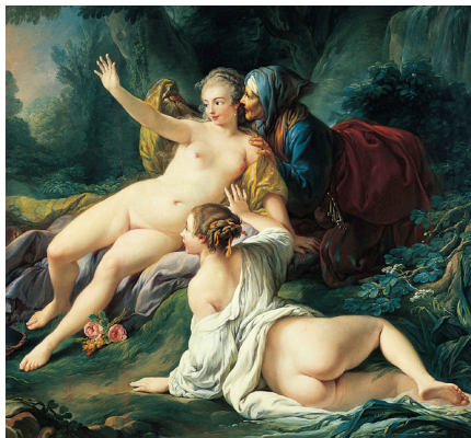
Jean-Baptiste Deshayes de Colleville (French, 1729–1765) Jupiter and Semele , c.1760 Oil on canvas 62-3/4 x 66-3/8 in. (159.4 x 168.6 cm) The Norton Simon Foundation