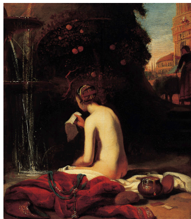
Cornelis Bisschop (Dutch, 1630–1674) Bathsheba , c. early 1660s Oil on panel 15-1/2 x 13-1/4 in. (39.4 x 33.7 cm) The Norton Simon Foundation

Image(s) are to be printed in their entirety and are not to be cropped, altered or manipulated in any way. Any alterations must be approved in writing by the Norton Simon Entities. Any unauthorized use of the photographic materials shall constitute an infringement of copyright laws. Please let us know if you have any questions or need additional materials. We would appreciate one copy of the publication or article in which the image(s) appears for our files. *Norton Simon Entities are comprised of the following: Norton Simon Museum of Art, Norton Simon Art Foundation and The Norton Simon Foundation.