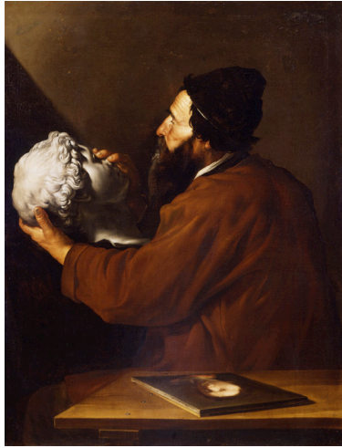
Jusepe de Ribera (Spanish, 1591–1652) The Sense of Touch , c. 1615–16 Oil on canvas 45-5/8 x 34-3/4 in. (115.9 x 88.3 cm) The Norton Simon Foundation

April 16–September 6, 2021 at the Norton Simon Museum