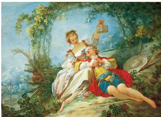
Jean-Honoré Fragonard (French, 1732–1806) Happy Lovers , c. 1751–1755 Oil on canvas 35-1/2 x 47-3/4 in. (90.2 x 121.3 cm) The Norton Simon Foundation