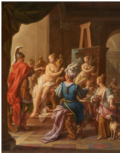
Francesco Trevisani (Italian, 1656–1746) Apelles Painting Campaspe , 1720 Oil on canvas 29-3/8 x 23-3/4 in. (74.6 x 60.3 cm) The Norton Simon Foundation