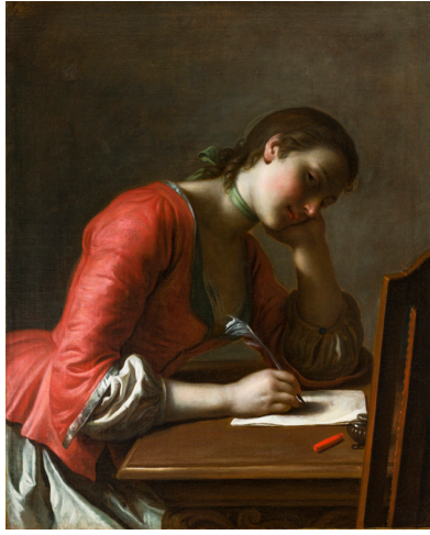
Pietro Antonio Rotari (Italian, 1707–1762) Young Girl Writing a Love Letter , c. 1755 Oil on canvas 33-3/8 x 27 in. (84.8 x 68.6 cm) Norton Simon Art Foundation

April 16–September 6, 2021 at the Norton Simon Museum