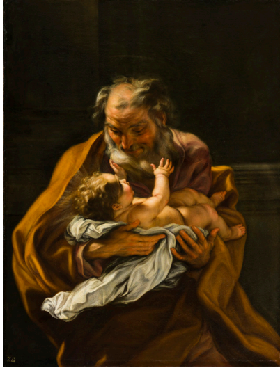
Giovanni Battista Gaulli (called Baciccio) (Italian, 1639–1709) Saint Joseph and the Infant Christ , c. 1670–85 Oil on canvas 50 x 38-1/4 in. (127 x 97.2 cm) The Norton Simon Foundation

April 16–September 6, 2021 at the Norton Simon Museum