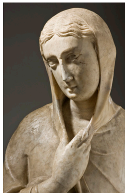
Attributed to Agostino di Giovanni (Italian, fl. Siena 1310–1347) The Virgin Annunciate (and detail), first half, 14th century Marble 37 x 11 x 6-1/2 in. (94.0 x 27.9 x 16.5 cm) The Norton Simon Foundation