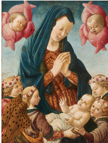
Francesco Botticini (Italian, 1446–1497) Virgin and Child with Four Angels and Two Cherubim , c. 1470–75 Tempera on panel 25-3/4 x 19-1/2 in. (65.4 x 49.5 cm) The Norton Simon Foundation