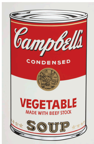
Andy Warhol (American, 1928–1987) Campbell's Soup I: Vegetable , 1968 Silkscreen on paper 35-1/2 x 23-1/8 in. (90.2 x 58.7 cm) Norton Simon Museum, Museum Purchase, 1969 © The Andy Warhol Foundation for the Visual Arts, Inc. / Licensed by Artists Rights Society (ARS), New York