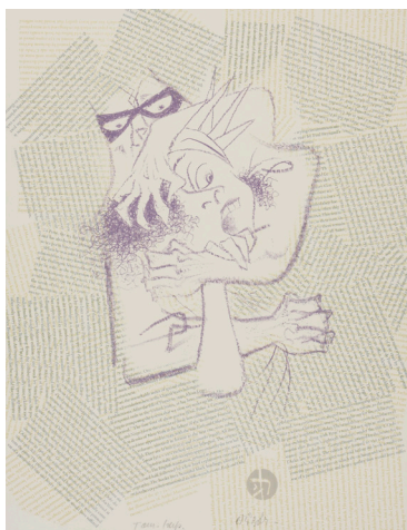
William Gropper (American, 1897–1977) Untitled (Unfinished Symphony I) , 1967 Lithograph 18 x 14 in. (45.72 x 35.56 cm) Norton Simon Museum, Anonymous Gift © Estate of William Gropper

August 11, 2023–January 8, 2024 at the Norton Simon Museum