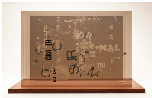
John Cage (American, 1912–1992)

© Estate of Pablo Picasso / Artists Rights Society (ARS), New York