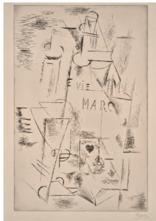
Pablo Picasso (Spanish, 1881-1973)