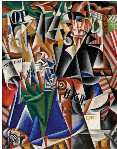
Liubov Popova (Russian, 1889–1924)

The image(s) provided are exclusively for the press and may only be used for purposes of publicity for the exhibition. Any other use will require written permission from the Norton Simon Entities*. All images are the property of the Norton Simon Entities. All copyright and credits must appear on the same or facing page(s) as the image(s). Please refer below for proper notation of image caption(s) and credit(s).