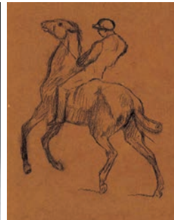
Jockey on Horse , c. 1882-88 Edgar Degas (French, 1834-1917) Charcoal with pastel on brown paper The Norton Simon Foundation