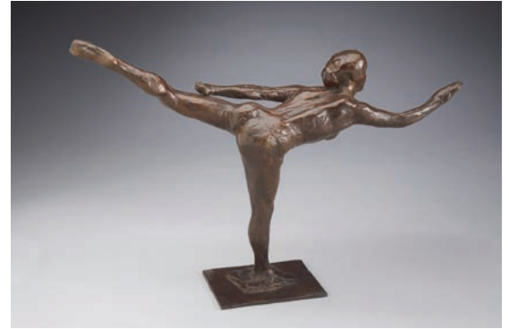
Arabesque over the Right Leg, Left Arm in Line , modeled 1885-90; cast 1919-21 Edgar Degas (French, 1834-1917) Bronze, No. 03, Modèle cast Norton Simon Art Foundation