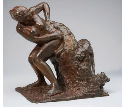
Seated Woman Wiping Her Left Side , modeled 1890s-1911; cast 1919-21 Edgar Degas (French, 1834-1917) Bronze, No. 46, Modèle cast Norton Simon Art Foundation