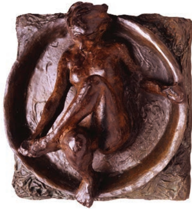
The Tub , modeled c. 1889; cast 1919-21 Edgar Degas (French, 1834-1917) Bronze, No. 26, Modèle cast Norton Simon Art Foundation

We are pleased to provide the following images for publicity relating to the exhibition. To receive digital versions of the images, please contact the External Affairs department at (626) 844-6900 or media@nortonsimon.org .