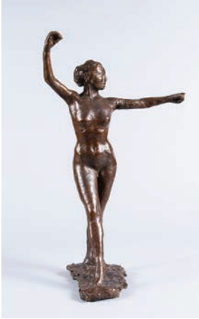
Dancer Ready to Dance, the Right Foot Forward , modeled 1885-90; cast 1919-21 Edgar Degas (French, 1834-1917) Bronze, No. 57, Modèle cast Norton Simon Art Foundation

We are pleased to provide the following images for publicity relating to the exhibition. To receive digital versions of the images, please contact the External Affairs department at (626) 844-6900 or media@nortonsimon.org .