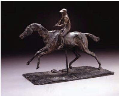
Horse Galloping on Right Foot, the Back Left Only Touching the Ground and Jockey , modeled 1890s; cast 1919-21 Edgar Degas (French, 1834-1917) Bronze, Nos. 25 and 35, Modèle casts Norton Simon Art Foundation