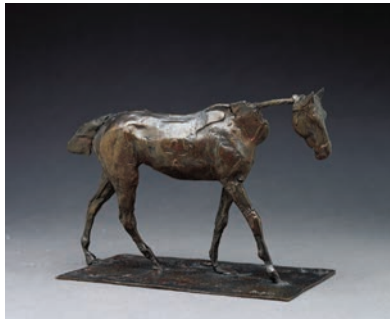
Thoroughbred Horse Walking , modeled early 1870s; cast 1919-21 Edgar Degas (French, 1834-1917) Bronze, No. 66, Modèle cast Norton Simon Art Foundation