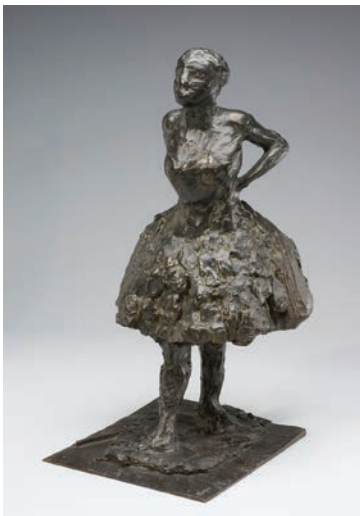
Dressed Dancer at Rest, Hands Behind Her Back, Right Leg Forward , modeled 1895-1905; cast 1919-21 Edgar Degas (French, 1834-1917) Bronze, No. 51, Modèle cast Norton Simon Art Foundation