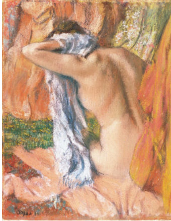
After the Bath , c. 1890-1893 (dated in error by another hand: 1885) Edgar Degas (French, 1834-1917) Pastel on tracing paper mounted on cardboard The Norton Simon Foundation