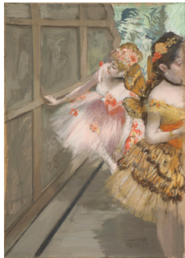
Dancers in the Wings , c. 1876-78 Edgar Degas (French, 1834-1917) Pastel, gouache, distemper, and "essence" on paper, mounted on board Norton Simon Art Foundation