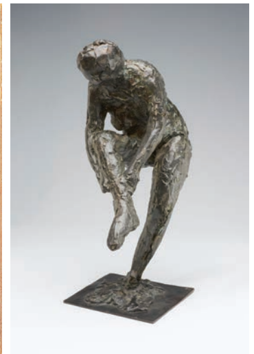
Dancer Putting on Her Stocking , modeled 1896-1911; cast 1919-21 Edgar Degas (French, 1834-1917) Bronze, No. 70, Modèle cast Norton Simon Art Foundation