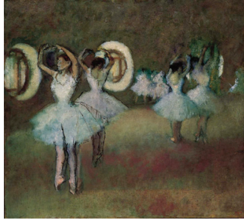
Dancers in the Rotunda at the Paris Opera , c. 1875-78 (reworked c. 1894) Edgar Degas (French, 1834-1917) Oil on canvas Norton Simon Art Foundation