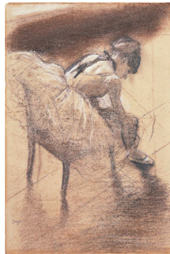
Seated Dancer Rubbing Her Leg , c. 1878 Edgar Degas (French, 1834-1917) Charcoal with white and dark brown pastel on gray-brown laid paper Norton Simon Art Foundation