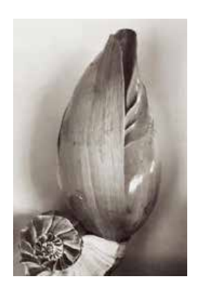
Edward Weston (American, 1886–1958) Two Shells, 1927 Gelatin silver print 9-5/16 \times 6-1/2 in. Norton Simon Museum, The Blue Four Galka Scheyer Collection