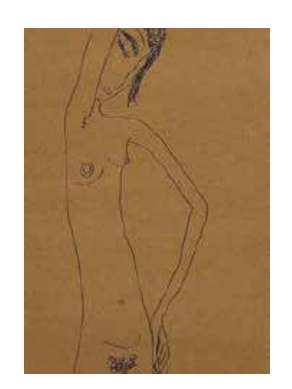
Edward Hagedorn (American, 1902–1982) Nude, c. 1926–27 Ink on brown wove paper mounted on wove paper comp: 10-7/8 x 7-3/4 in.; sheet: 19-1/8 x 12-1/2 in. Norton Simon Museum, The Blue Four Galka Scheyer Collection