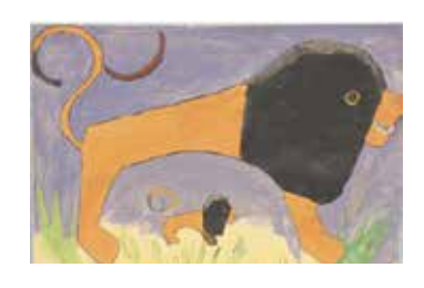
Students of Galka E. Scheyer

Mz 296. Soup, 1921 Collage with pasted paper and cloth on cardboard comp: 5 \times 3-3/4 in.; mount: 6-5/8 \times 5-1/4 in. Norton Simon Museum, The Blue Four Galka Scheyer Collection