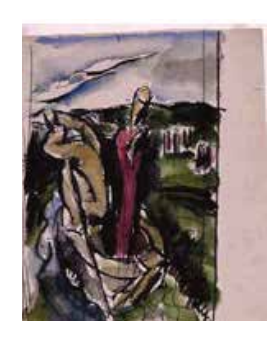
Edward Hagedorn (American, 1902–1982) River Styx, Flying Geese , c. 1926–28 Watercolor and ink on wove paper 13-1/4 x 11-1/8 in. Norton Simon Museum, Anonymous Gift