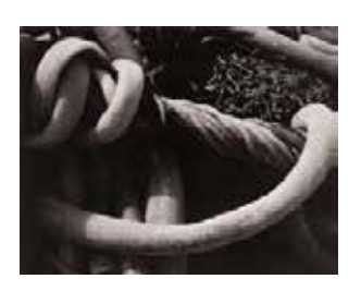
Edward Weston (American, 1886–1958) Kelp , 1930 Gelatin silver print, ed. 7/50 7-1/2 x 9-5/8 in. Norton Simon Museum, The Blue Four Galka Scheyer Collection