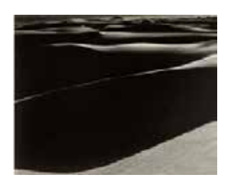
Edward Weston (American, 1886–1958) Dunes, Oceano, 1936 Gelatin silver print mounted on cardboard 7-5/8 x 9-5/8 in. Norton Simon Museum, The Blue Four Galka Scheyer Collection