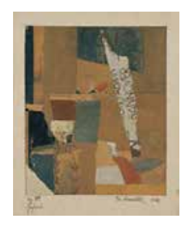
Figure H2, 1921 Lithograph on pink wove paper 19-1/4 x 13-1/2 in. Norton Simon Museum, The Blue Four Galka Scheyer Collection