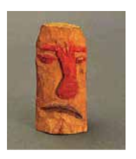
T. Lux Feininger (American, b. 1910) Head , 1923 Gouache and pencil on wood 4 x 1-7/8 x 1-1/2 in. Norton Simon Museum, The Blue Four Galka Scheyer Collection