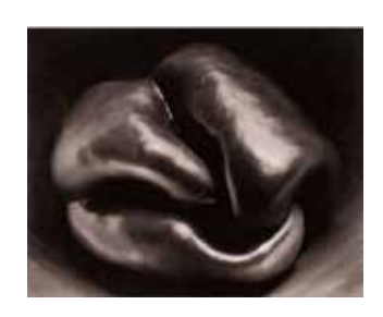
Edward Weston (American, 1886–1958) Pepper, 1930 Gelatin silver print, ed. 6/50 7-1/2 x 9-1/2 in. Norton Simon Museum, The Blue Four Galka Scheyer Collection